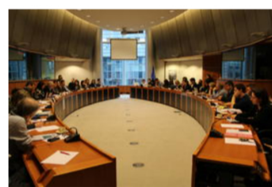
The seminar at the European Parliament