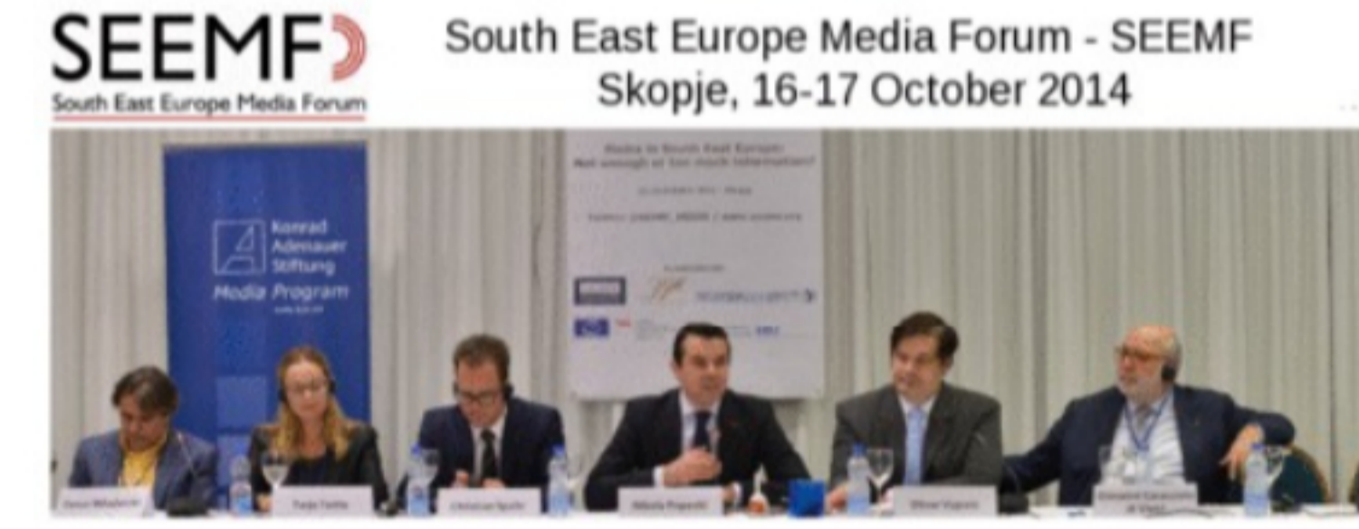
The South East Europe Media Forum (SEEMF2014) was organised by SEEMO in Skopje from 16 to 18 October with the participation of Osservatorio Balcani e Caucaso and the project 'Safety Net'