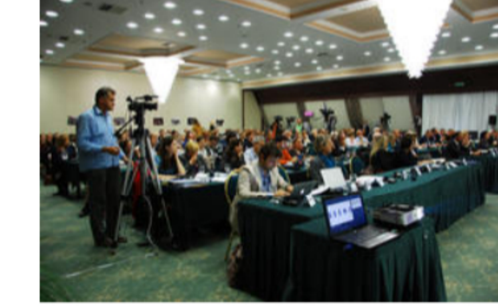
South-east Europe Media Forum (SEEMF)